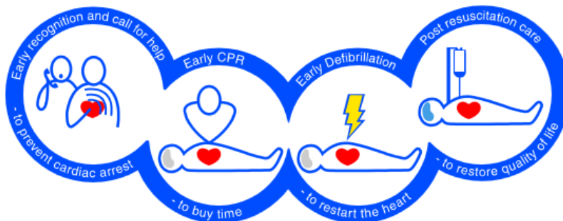
Figure 1: The chain of survival

The school has an automated external defibrillator (AED) on site, which is stored in the school office and can be used as part of the chain of survival (figure 1). This is a small electronic device that analyses a person's heart looking for irregular heart rhythms known as sudden cardiac arrest. The AED corrects these irregular heart rhythms by delivering a lifesaving shock of electricity. The AED uses voice prompts to guide users through its use and can therefore be used by any member of staff (although First Aid trained staff have received more training on their use). Please see here for more information. The office is responsible for checking the AED is in working order and pads are in date.